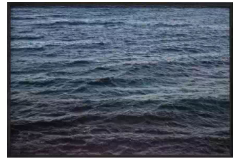
MIGUEL ROTHSCHILD Bendana | Pinel Art Contemporain 10 Sep - 29 Oct